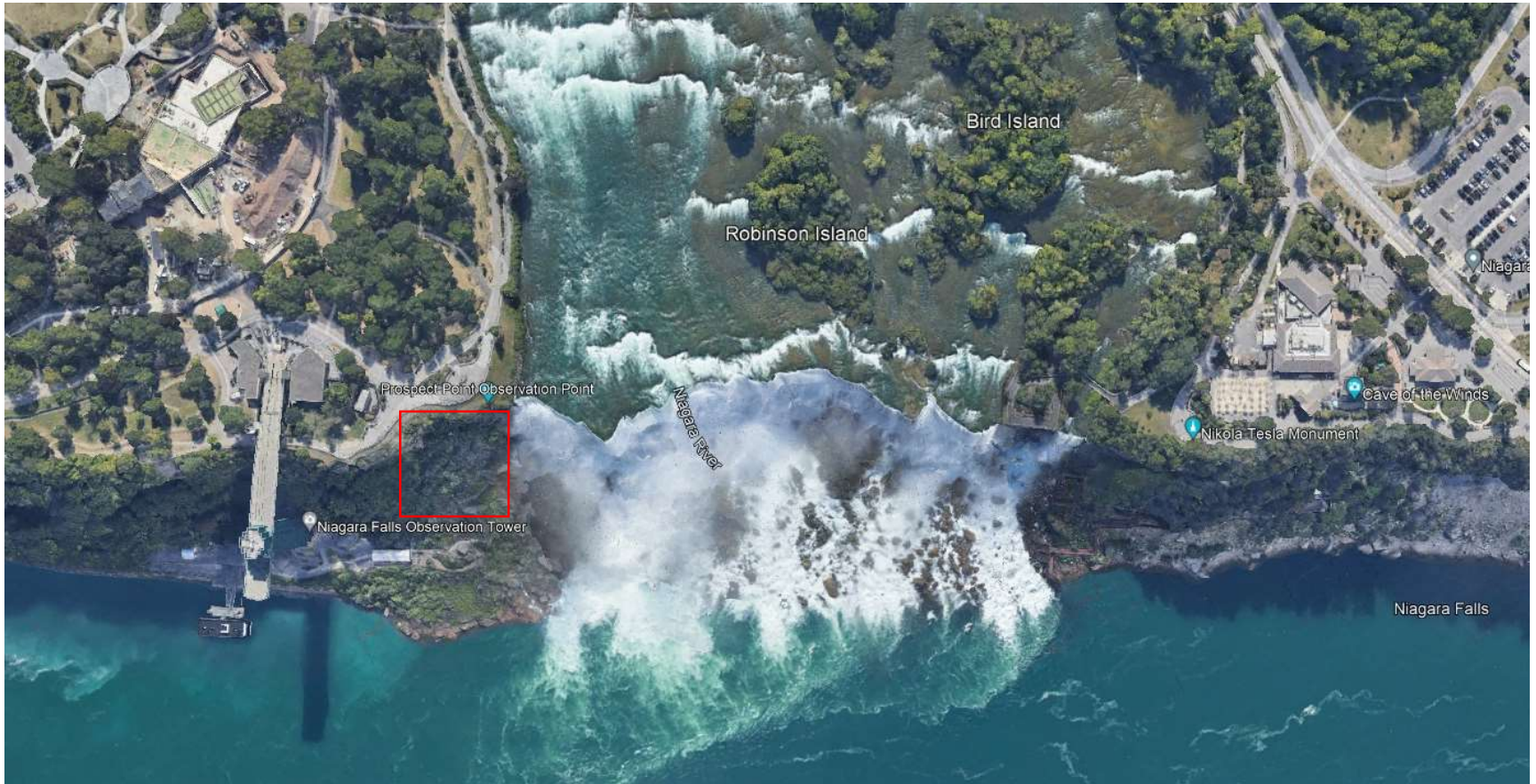
Figure 2: Project location at Niagara Falls State Park shown by red box