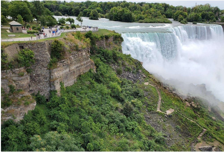
Photo 1: Existing view looking from the observation tower to the south-east