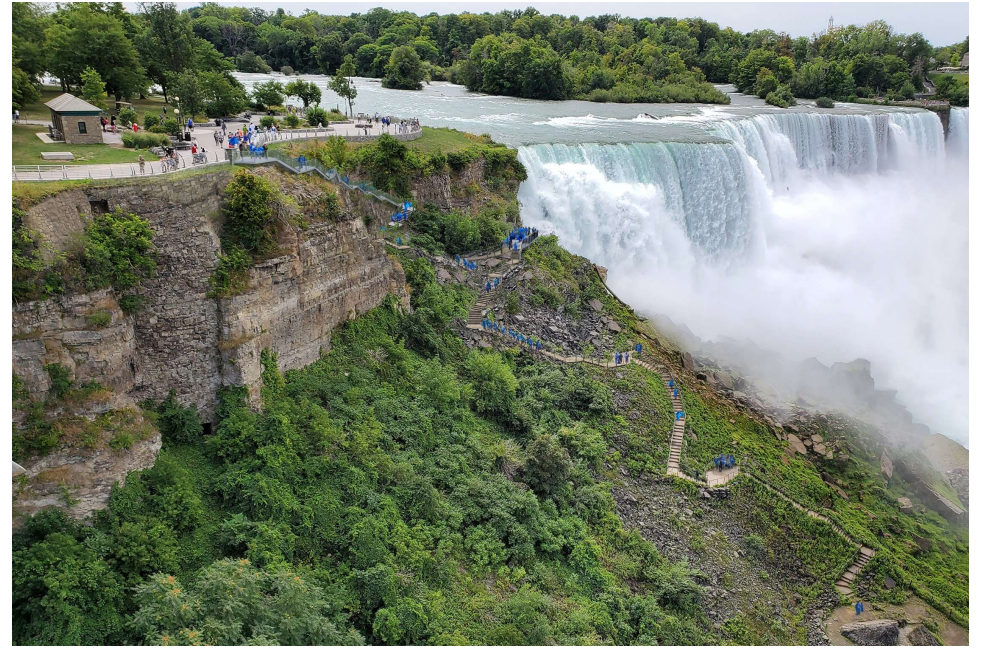
Photo 2: Proposed view looking from the observation tower to the south-east