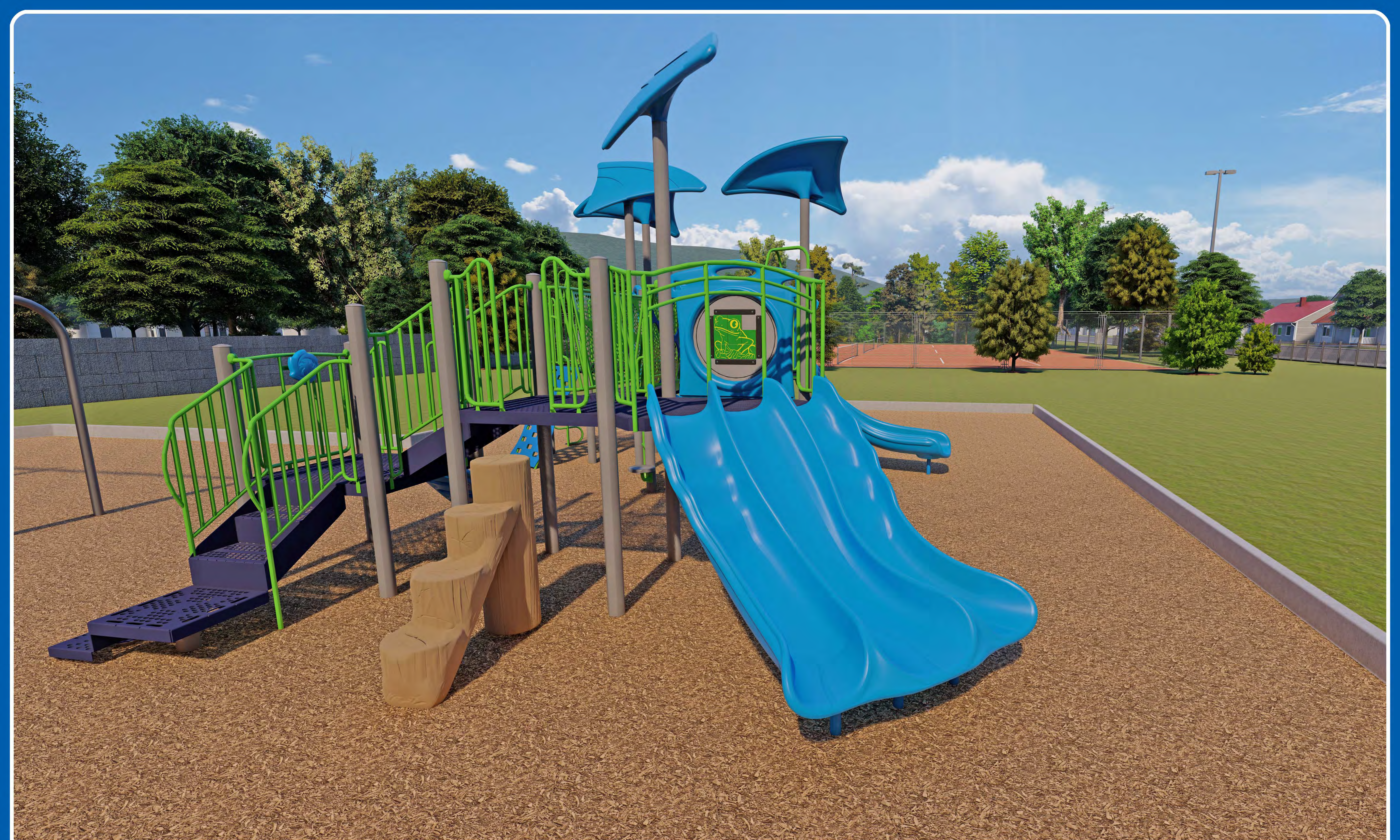
Sanborn Park - Lewiston, NY View B