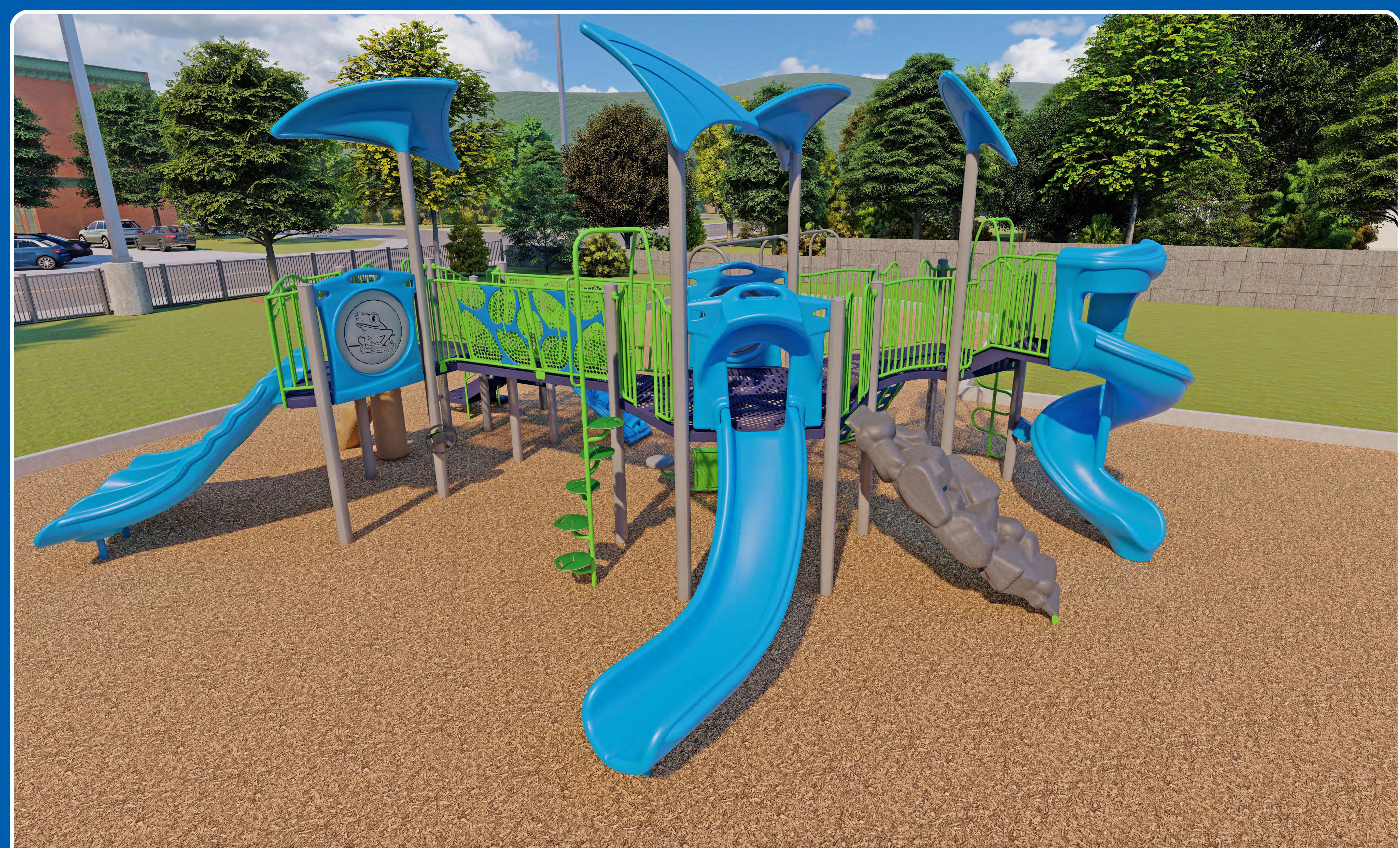
Sanborn Park - Lewiston, NY View C